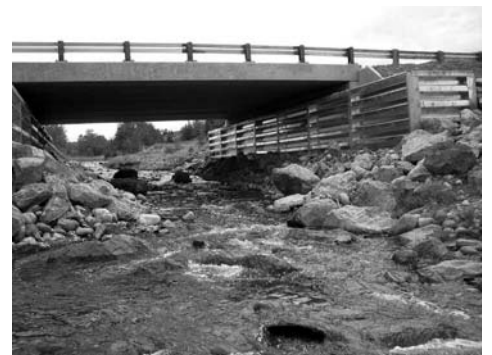
West Fraser Mills Ltd. Hardisty Creek crossing before and after restoration.