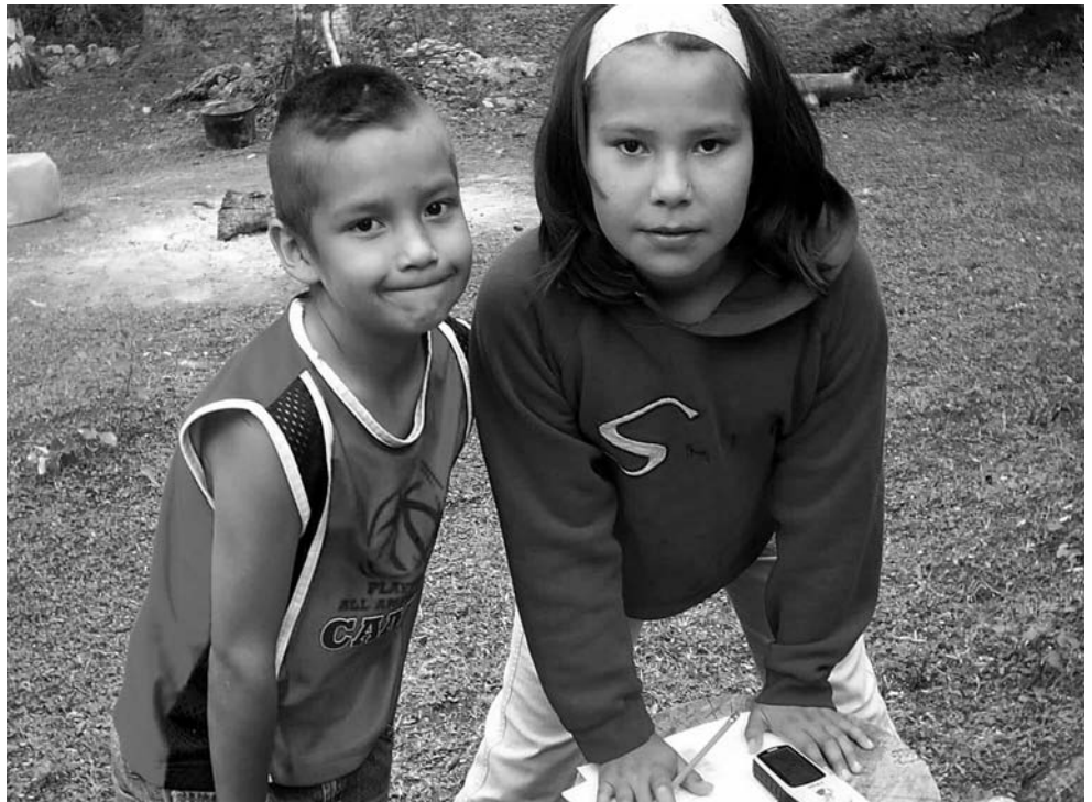
GPS Units are used to document the geographical locations of culturally important sites.

As Foothills Model Forest moves into its next phase, the Aboriginal Involvement Program will continue to evolve and grow, says Young, and perhaps even one day become self-sufficient as a stand-alone entity.